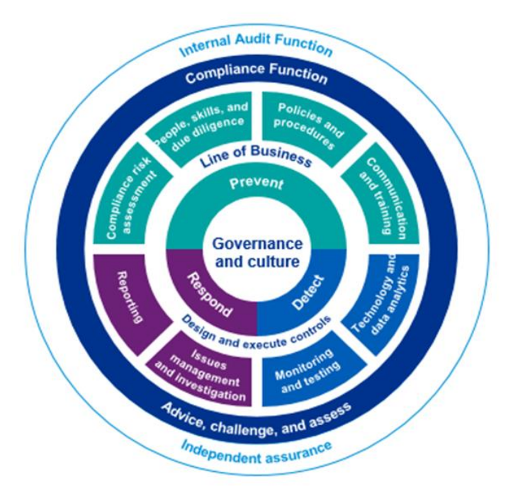
Illustration I: The Compliance Program of KoçZer

Prevention is managed by Compliance risk assessments, due diligence practices, written policies and procedures as well as communication and trainings. Detection, is supported by technology and data analysis as well as monitoring, testing and audit practices. Response refers to investigations and reporting activities.